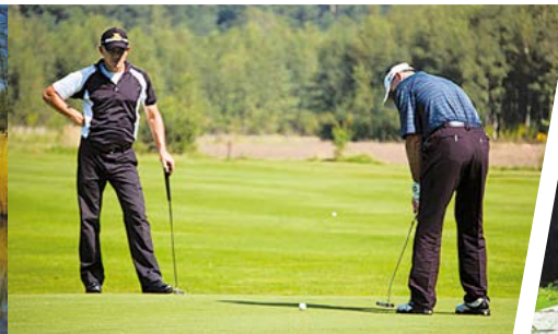
Era Golf Lázně Bohdaneč

We must mention Bubeníkovy sady , a public park with the beautiful lily-covered Matiční lake . A relic dating from the 15th century, when Vilém of Pernštejn had the castle converted into a chateau, are the chateau walls , which are a must-see when touring Pardubice Chateau. Now, with Tyršovy sady , the chateau walls are a green oasis of tranquillity in the centre. You can also relax in the Natura Park