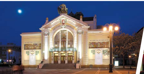
East Bohemia Theatre