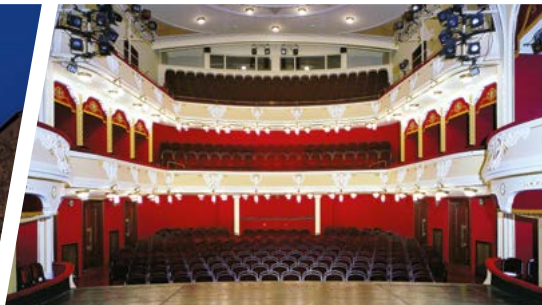
East Bohemia Theatre – interior