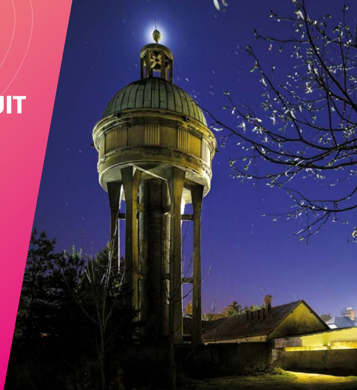
Gočár Trail (town of Lázně Bohdaneč)