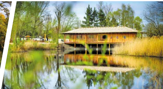
Na Špici Park

the history of our country! Pardubice offers several places to rest and relax very close to its monuments. It is proud of the care it takes of the town parks , so these are an oasis of tranquillity in the centre of town – including Park Na Špici , which is where the Labe meets the Chrudimka , and hosts many sports events.