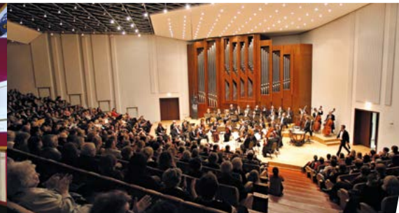
Suk Hall of the Music House