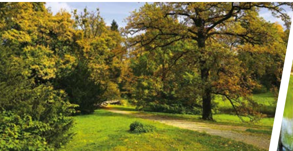
Choltice game reserve

Another of the region's gems is Choltice game reserve , which connects to the chateau park and contains spectacular oaks, beeches and ash trees. At Valy don't miss the Struha Meanders natural monument. The foothills of the Iron Mountains offer a unique site – the National Geopark. Visit the Raškovice quarries trail with its six stops, the Barborka lookout tower or the Brloh geo-site, mapping