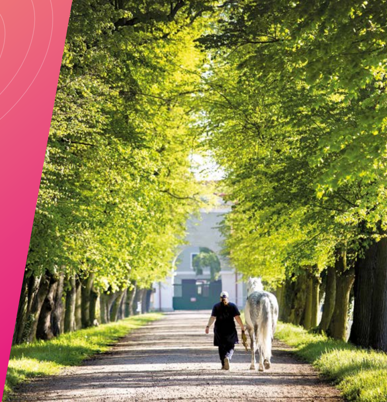
Vysoké Chvojno Arboretum