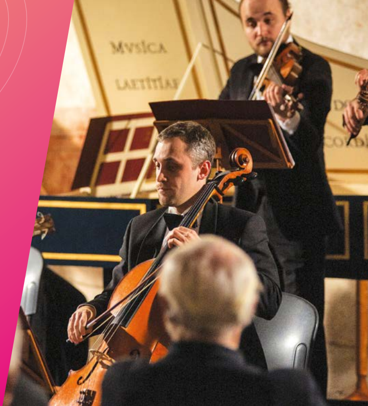
East Bohemia Museum