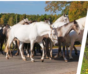
Horses in Pardubicko