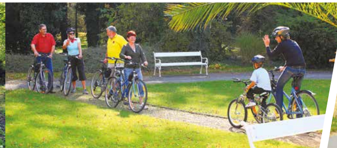
Cycling in Bohdanečsko