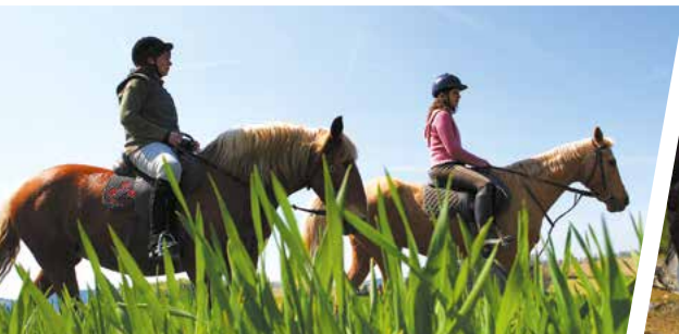
Horse trail in Pardubicko