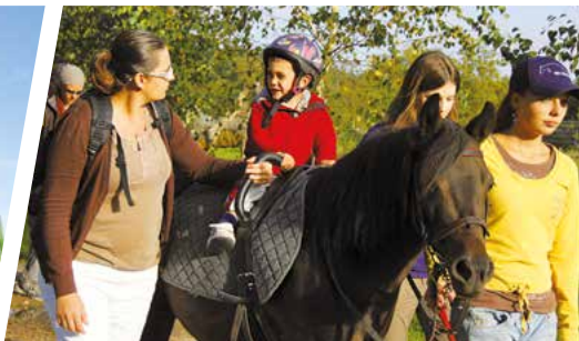
Apolenka horse riding school