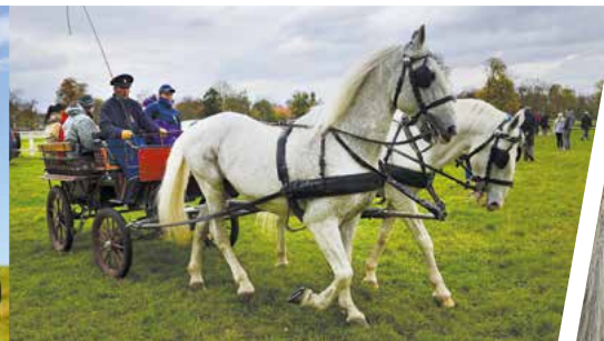
Kladruby nad Labem national stud farm