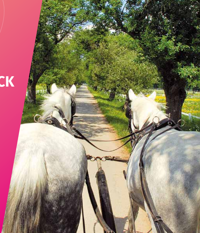
Horses in Pardubicko