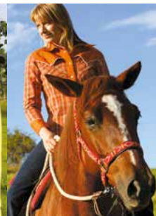
Horses in Pardubicko