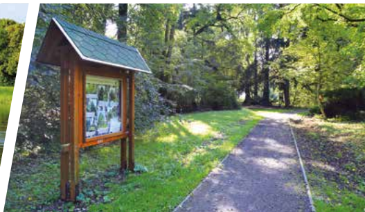
Vysoké Chvojno arboretum