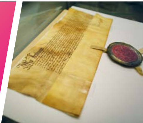
Arnošt of Pardubice will