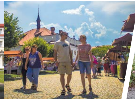
Magdalena fair (town of Lázně Bohdaneč)

also be reminded of the personality that influenced the shape of Lázně Bohdaneč on the Gočár circuit nature trail. The trail starts and finishes on Masarykovo náměstí . One of the stops is also the spa park with beautiful natural vistas. No matter whether you visit Lázně Bohdaneč as a client or as a tourist, it is an ideal place to enjoy peace and relaxation.