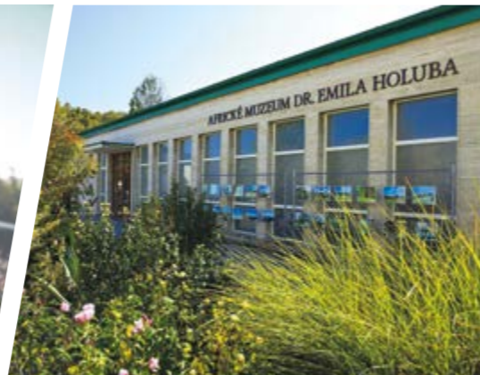
Dr. Emil Holub African Museum

spa in Bohdaneč was an important milestone. The Kunětická hora Castle awaited reconstruction for a long time. The plundered building quickly became dilapidated, which was accelerated by the plundering of its high-quality stonework.