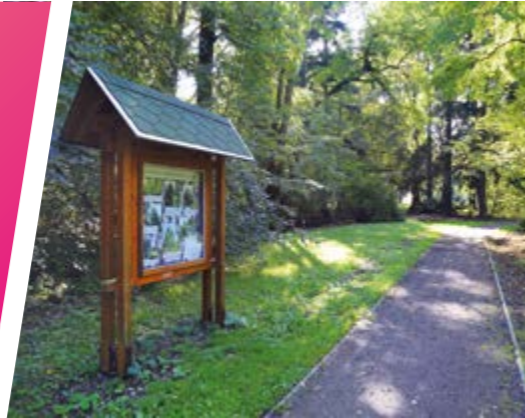
Vysoké Chvojno arboretum