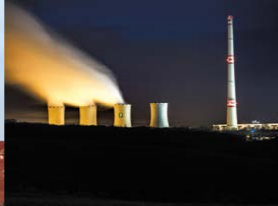
Chvaletice power station