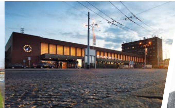
Pardubice main station

The flourishing of the area was stopped by the German occupation, which also led to the rise of a strong local resistance movement in the whole area and region. A parachute group, Silver A , significantly influenced the local resistance movement. Its members found help and shelter here during the preparations for the assassination of R. Heydrich. One member of the parachute group, Jiří Potůček , was hid in a fish tank near Lázně Bohdaneč from where he delivered messages via the Libuše transmitter to London.