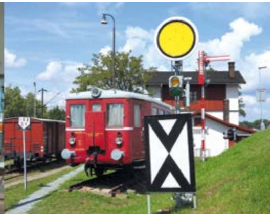
Museum of MHD and Railway