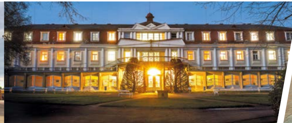
Gočár Pavilion ( www.carokraj.cz )