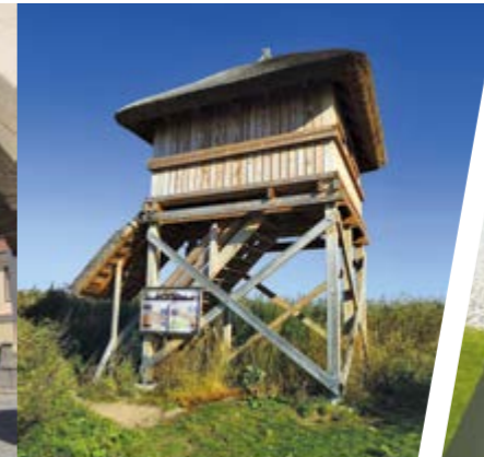
Bohdaneč ponds, observation tower