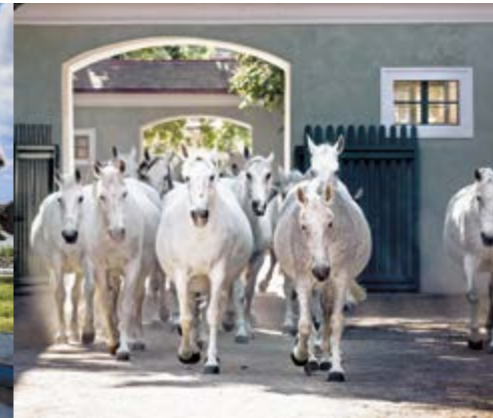
Old Kladruher horses