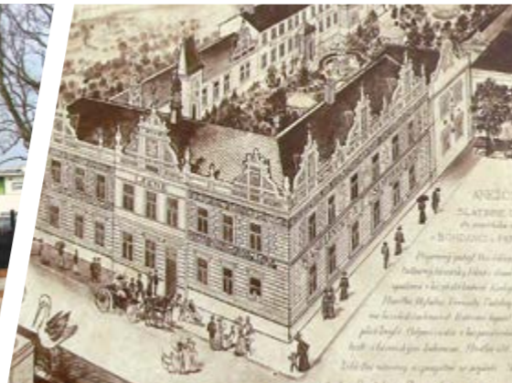
Bohdaneč Therapeutic Spa