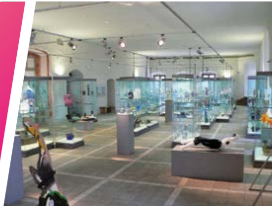
East Bohemia Museum