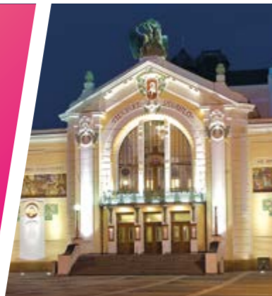
Pardubice East Bohemia Theatre