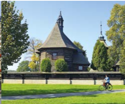
Church of St. Nicholas, Veliny