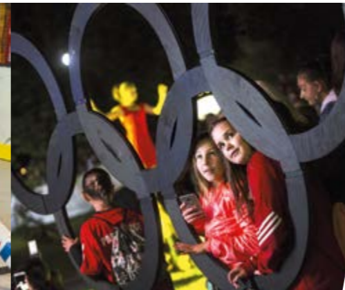
Pardubice Olympic Park