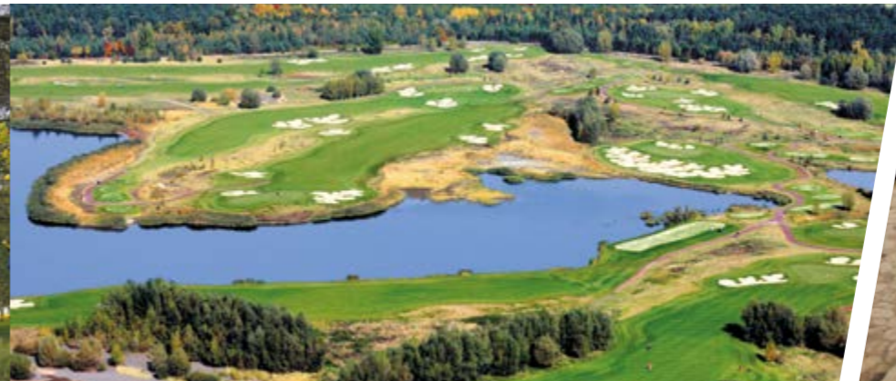
Kunětická Hora golf resort