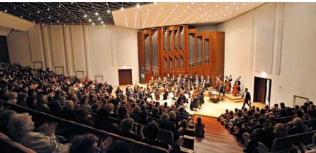
Pardubice Music Spring