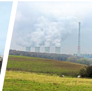
Chvaletice power station

Industry is well developed in Pardubicko, so no wonder you come across industrial sites and engineering structures on a visit. But, you don't need to avoid them, in fact you could appreciate their unconventional beauty.