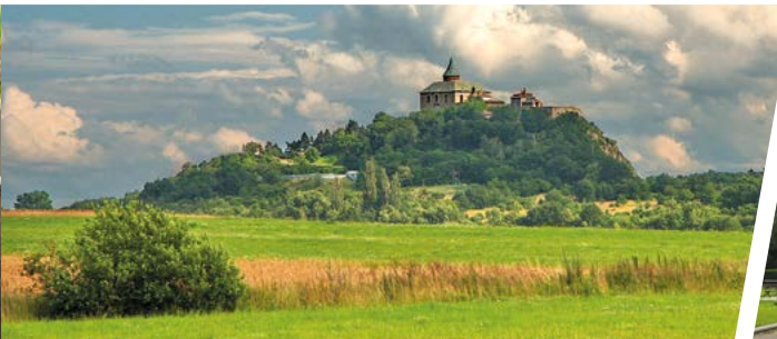
Kunětická hora Castle

Scenes have been shot in the rest of Pardubicko, too. In 1955 the Choltice nature reserve was the setting for Karel Steklý's Bagpiper of Strakonice . Kunětická hora castle is now inseparably linked with Václav Vorlíček's children's TV serial Arabela (1979) and is gleefully known as the home of Rumburak. The Church of St. Wenceslas and Leopold in Kladruby nad Labem featured in František