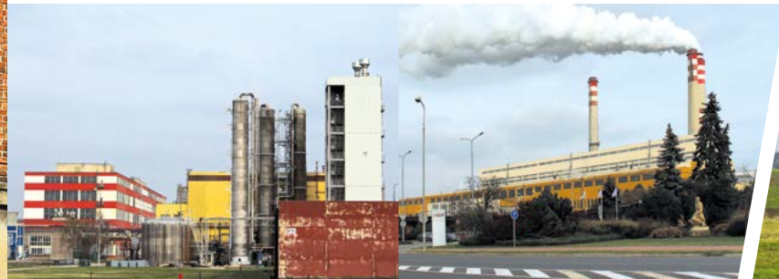
Opatovice nad Labem power station