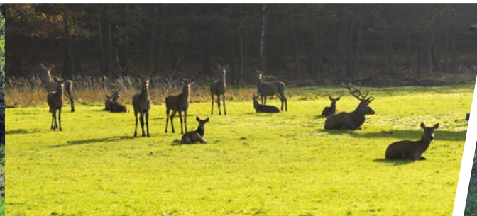
Vysoké Chvojno animal corner