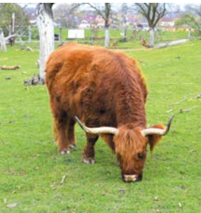
Nature reserve below Kunětická hora